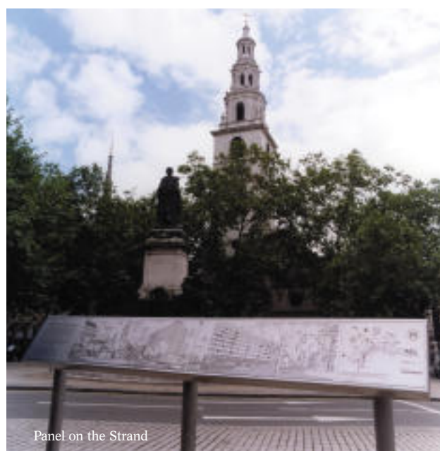
Panel on the Strand