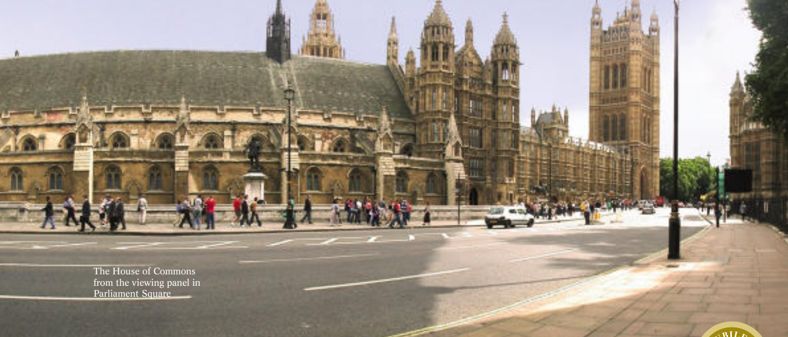
The House of Commons from the viewing panel in Parliament Square