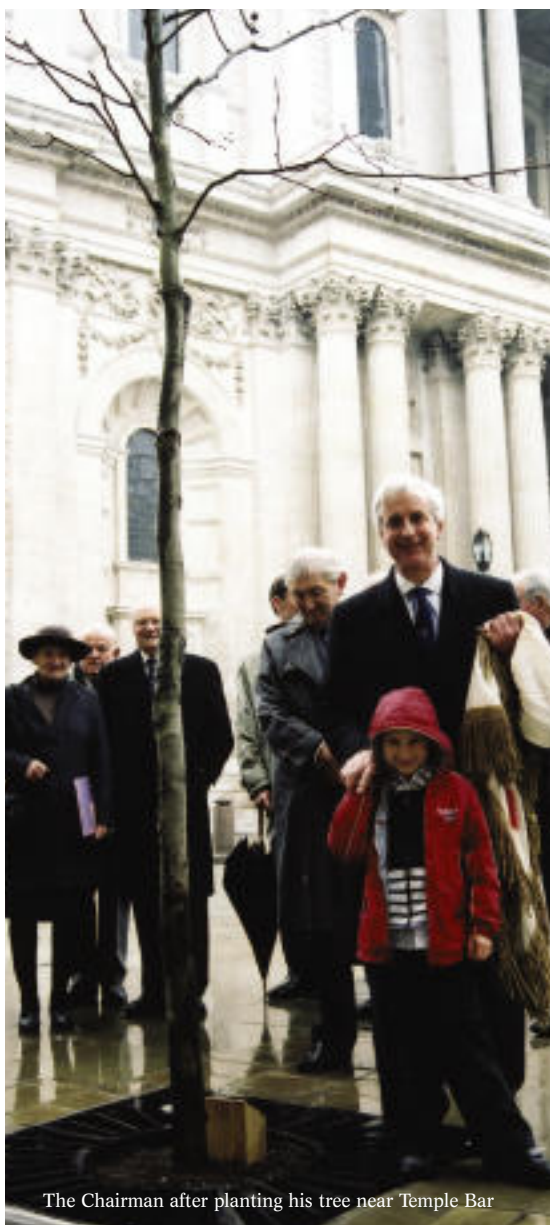
The Chairman after planting his tree near Temple Bar