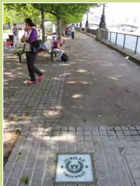
Jubilee Greenway waymarkers: South Bank, Lambeth Bridge, South Bank