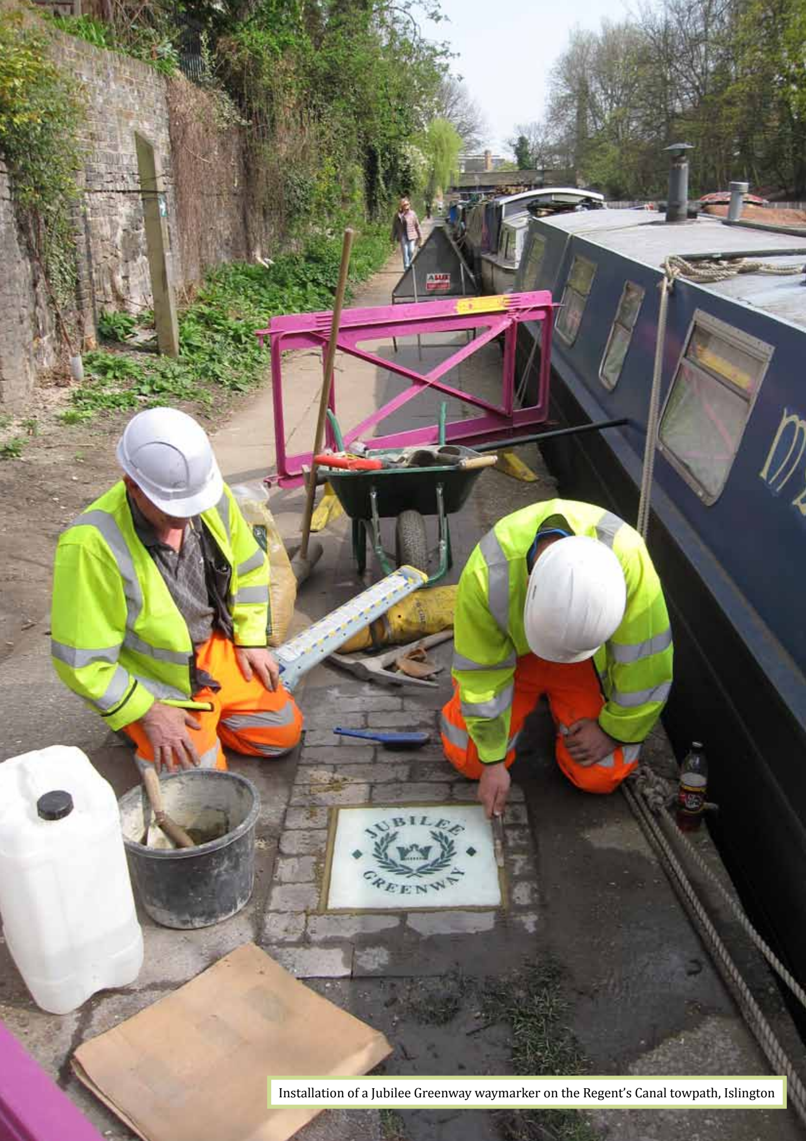
Installation of a Jubilee Greenway waymarker on the Regent's Canal towpath, Islington